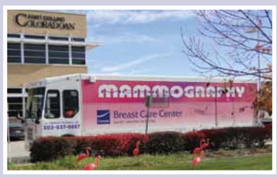
Women's Resource Center, a Community Grantee, provides free screenings to low-income women with a mammogram mobile unit