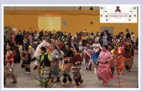
Community Grantee the American Indian Cancer Foundation hosts a Powwow on cancer prevention & early detection

annual Powwow for Hope that brought together several tribal nations across the Midwest to honor cancer survivors and increase awareness and education among American Indian families.