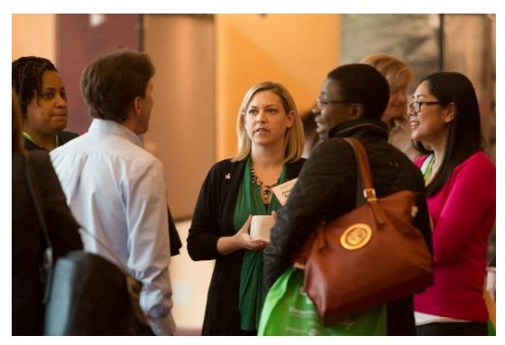
Networking at the 2015 Dialogue for Action

"All the speakers were wonderful. The breakout sessions and awards lunch provided an excellent opportunity to meet people. The poster session was a great value-add."