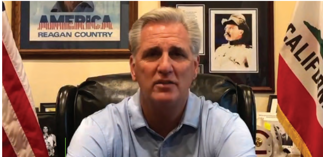
House Speaker Nancy Pelosi and House Republican Leader Kevin McCarthy welcomed everyone virtually.