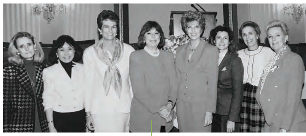
Inaugural Action for Cancer Awareness Awards Luncheon held in 1993

Over the years, we have created new initiatives and strengthened our founding activities. In addition to our popular op-ed program, in the past few years, "Posting with a Purpose" has allowed spouses, and more recently members of Congress, to reach their constituents through social media. We have traveled in bipartisan groups to spouses' home states to highlight local organizations working to reduce cancer in medically underserved populations. And we have supported spouses who have organized educational events in their communities by providing information, materials and speakers.