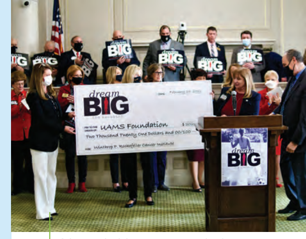
Arkansas legislators present a check to the UAMS Foundation.

"NCI-Designated Cancer Centers." National Cancer Institute, updated on website June 24, 2019. <a href="https://www.cancer.gov/research/infrastructure/cancer-centers">https://www.cancer.gov/research/infrastructure/cancer-centers</a>