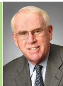
In Memoriam: Prevent Cancer Foundation Board Member The Honorable Vic Fazio

The Congressional Families Cancer Prevention Program and the Prevent Cancer Foundation are deeply saddened by the loss of former Congressman Victor "Vic" Fazio (CA), who died on March 16 of melanoma. Former Rep. Fazio served on the Foundation's board of directors since 2015, transitioning to sustaining director in 2022. His unwavering support, kindness and belief in our vision of a world where no one dies of cancer will be remembered not only by the Foundation, but by all who knew him on Capitol Hill and beyond.