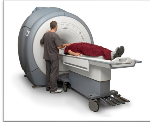
Practice Expense (TC)